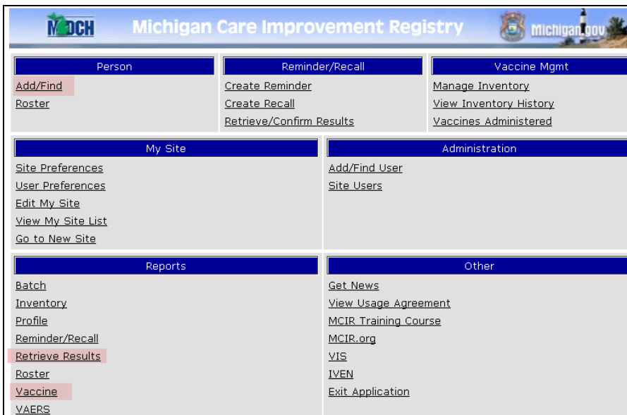
Figure 1: MCIR Home Page. The three highlighted links (Add/Find, Retrieve Results, and Vaccine) will be referred to in this tip sheet.

Once the registration process has been completed, you will be able to click on the Michigan Care Improvement Registry link at the DCH Application Portal. Clicking on this link will take you to the MCIR Home Page (Figure 1). The MCIR News Screen will popup over the MCIR Home Page. If you do not see the News Screen you have a popup blocker that must be disabled. Refer to the How to Disable Common Popup Blockers tip sheet at: http://www.mcir.org/forms/How%20to%20Disable%20Common%20Pop-Up%20Blockers%20June%202006.pdf