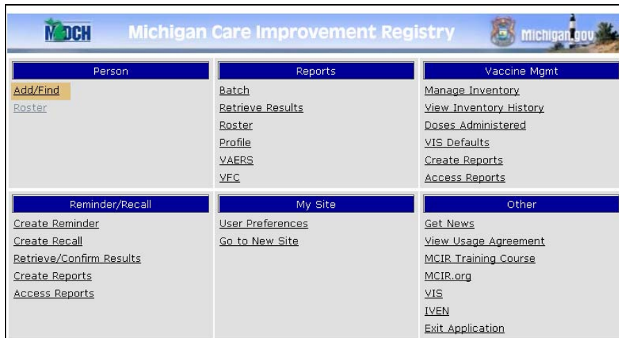
Figure 1: MCIR Home Page. The highlighted link (Add/Find) will be referred to in this tip sheet.

Once you have completed the registration process, you will be able to click on the Michigan Care Improvement Registry link at the DCH Application Portal. Clicking on this link will take you to the MCIR Home Page (Figure 1). The MCIR News Screen will popup over the MCIR Home Page. If you do not see the News Screen, you have a popup blocker that must be disabled. Refer to the How to Disable Common Popup Blockers tip sheet at: http://www.mcir.org/forms/How%20to%20Disable%20Common%20Pop-Up%20Blockers%20June%202006.pdf